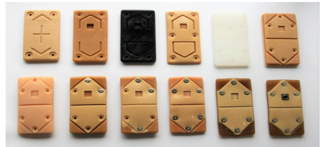
Figure 3: Initial prototype versions.

The prototype is connected to an Arduino Leonardo microcontroller, which transforms the gestures and button presses in keyboard entries on a connected computer. Each gesture performed in BendyPass becomes a letter on the